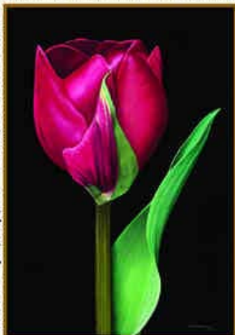
"Red Tulip", o/p, 34" X 24", CEES PENNING