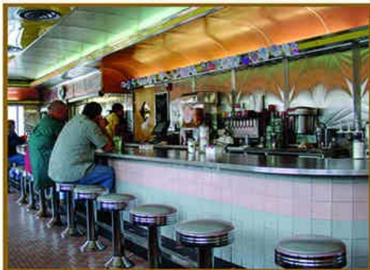
"DINER BLUES", o/c, 28" X 36", RANDY FORD