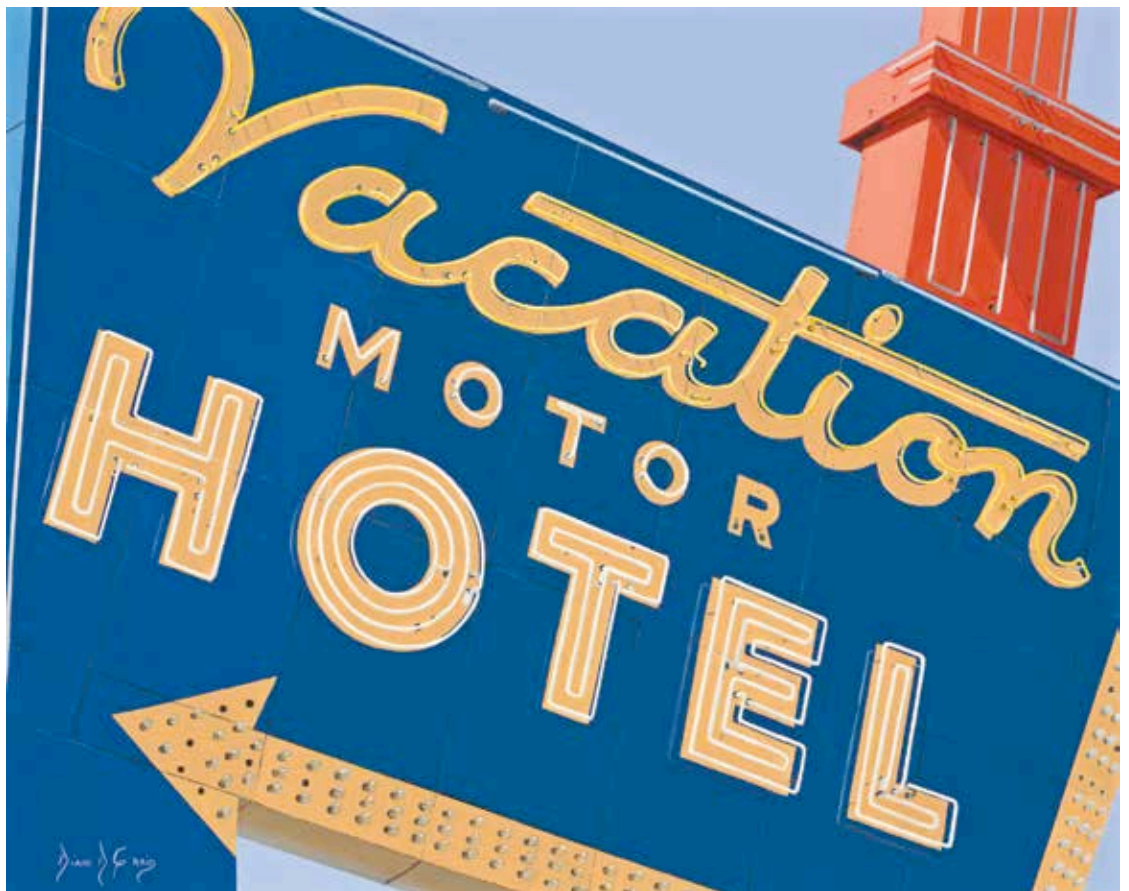
9 Diane Davich-Craig, Vacation Motor Hotel , oil on panel, 16 x 20"