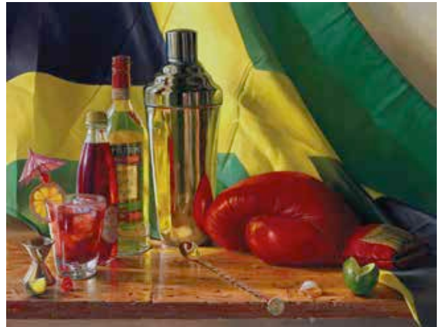
7 Guenevere Schwien, Modern Beauty , oil on wood, 24 x 36"