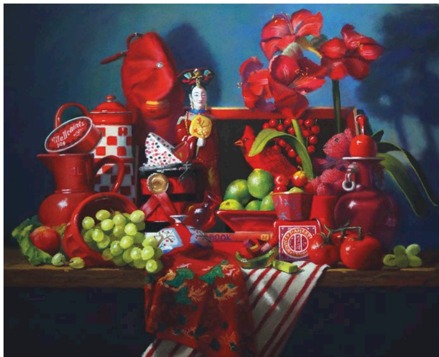
1 Claudia Seymour, Seeing Red , soft pastel, 17 x 21"

The International Guild of Realism's 12 th annual Juried Exhibition features paintings by more than 90 artists.