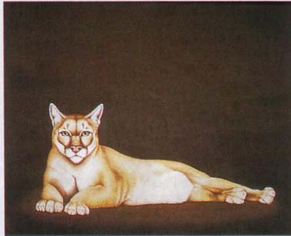
ISABELLE du TOIT, Grapevine, Texas Mountain Lion 48 x 60" (120 x 152cm), oil — Gold Medal